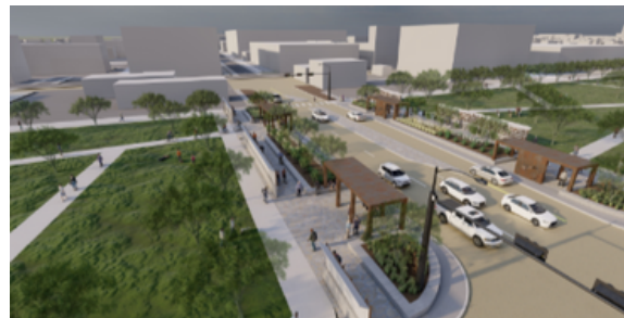
Potential 6th Street Cap

Caps are also referred to as decks, land bridges, or lids, are placed over a lowered highway. See the example a potential 6th Street Cap.