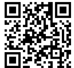
Scan Here for More Cap & Stitch Info