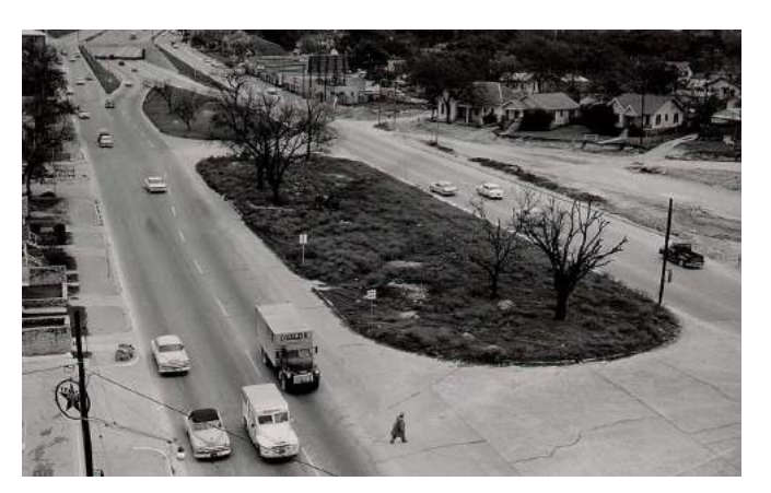
Austin, TX East Side in 1960.

Even shortly after passage of the Fair Housing Act in 1968, Austin wrestled with housing discrimination. After the act became law, the Austin City